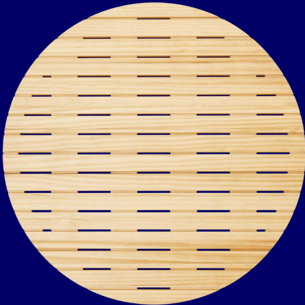
(Vieser Dot Accoya oiled)